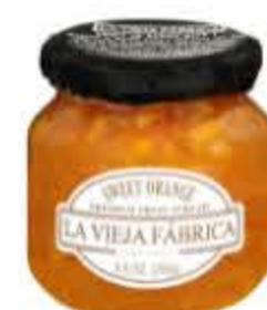
La Vieja Fabrica Sweet Orange Fruit Spread

Available for purchase at Walmart and Amazon.com